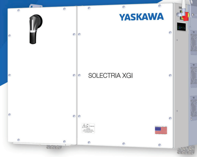
SOLECTRIA XGI 1500